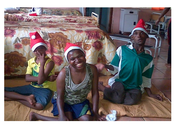
Some of the children at Madidi Disabled Home